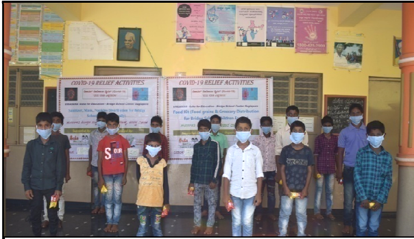
“COVID-19 Awareness programme for Bridge School Children and their Parents”

Asha for Education - Bridge school children programme is going on at Duglapura village which is 13km distance from Tarikere block, Chikmagalur district. This children center is running by VIKASANA with the support of ASHA for Education, Seattle . The center is ensuring educational support to 25 children who had educational gap due to various reasons and also children from economical poor backward families. An importance is also