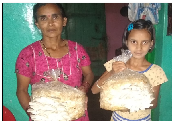
“Mushroom Cultivation – IGP Activity in Veerapura”

To sustain the rural livelihood and to ensure self employment habits among the rural communities, VIKASANA has been supporting and encouraging towards income generation and entrepreneurship management activities for 850 poor and low income families living in 20 villages of drought prone region of Kadur block, 26 villages in Koppa and Sringeri and 10 villages in Tarikere block. Through this intervention of Vikasana many families are earning an additional income in their family which is contributing to the financial stability of the families. One person