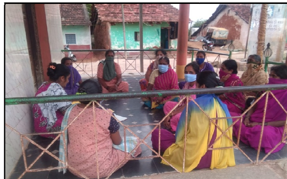
“Savings and Discussion at SHG Meeting at Kudluru”

Besides, capacity building and strengthening services rendered to almost 115 formed SHGs in 56 villages and who pool their thrift regularly and use the thrift to make small interest bearing loans to members. Credits made people to receive additional money from adopted income generating programmes like Dairy, Goat /Sheep rearing, starting of self employment and even for family needs like marriages and festival celebrations. Several groups are registered and have obtained financial assistance from the Banks, NABARD RO, Sangamitra finance and Local Banks. Initiatives invited to make these groups as permanent existence in project villages for further development, sustainability of the project activities and collective action.