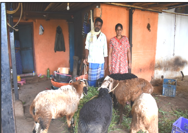
“Sheep Rearing – IGP Activity at Mallenahalli”