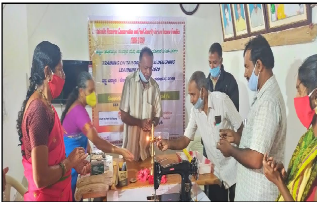
“Inauguration of tailoring center at Siddarahalli”

Around 1108 Low income families has been benefiting from the project intervention. We have formed CBOs such as SHGs, and WDCs are effectively functioning and are strengthened. The savings habit of women has increased from day to day. Due to series of training/exposure visit, the knowledge of beneficiaries on social issues as well as government schemes has improved and they are accessing them now. Besides, they understood the importance of people participation in village development. 25 farmers on organic farming/Cultivation and importance to soil and water conservation was improved better as a result of various training, meeting, home visit followed by sustainability orientation/initiatives. As a result, farmers are keep continued the organic farming strategies in their agriculture land along with utilization of watershed treatments implemented.