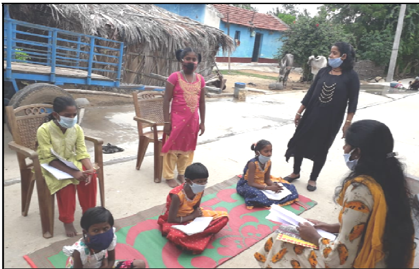
“Special classes for children in their Village due to COVID 19 Pandemic situation”

In the academic year 2020-2021, thirty three girl children were accommodated and rehabilitated for their continued education at K. Chattanahalli children center with the support of Karl Kübel Stiftung for Child and Family, Germany and Anna Schmidt School, Frankfurt, Germany . These children were identified from 30 economically backward villages of Chikmagalur, Koppala and Shimoga district. The main objective of this programme is to provide a space for