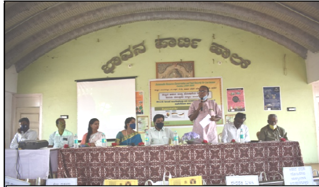
“Block Level Workshop along with MLA, Taluk Panchavat President. NGO Networks”

Sustainable resource conservation and food security project for low income families was successfully implemented to bring reduction of poverty and increase average household food security of low-income families living in 14 backward villages of Tarikere block. The project was started in late September 2019 and is successfully going on in 14 villages of Tarikere block, Chikamagalur district with the financial support from Karl Kübel Stiftung (KKS/BMZ) Germany. The project was expected to be completed by the end of December 2020 but due to the pandemic situation the project was continued till the end of March 2021.