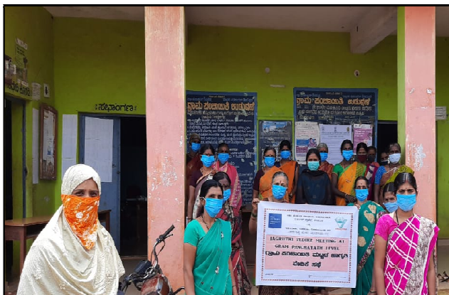
“Jagaruthi Vedike Meeting at Udugani Gram Panchyath”