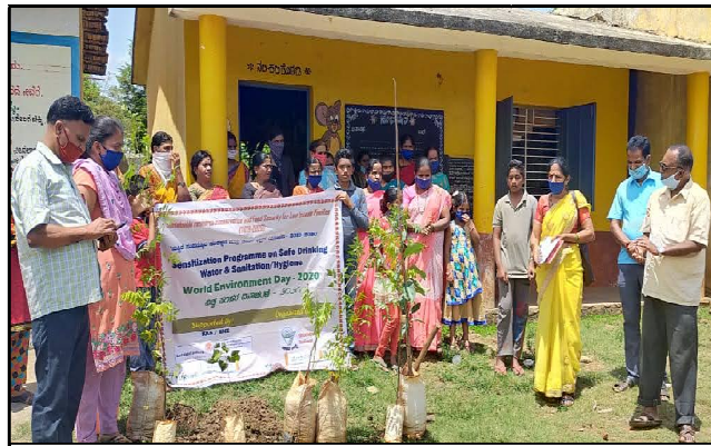
“World Environment Day Celebration at Mallenahalli School Ground”