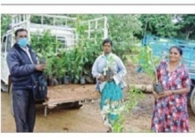
ಬದು ನಿರ್ಮಾಣ ಕಾರ್ಯದ ಸಂದರ್ಭದಲ್ಲಿ ವಿಕಸನ ಸಂಸ್ಥೆಯ ಅಧಿಕಾರಿಗಳು ಮತ್ತು ಸ್ಥಳೀಯ ಜನತೆ ಸೇರಿ ಪರಿಶೀಲನೆ ನಡೆಸುತ್ತಿರುವುದು.