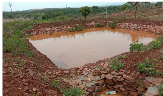
“Farm Pond during rainy season in Kudluru”