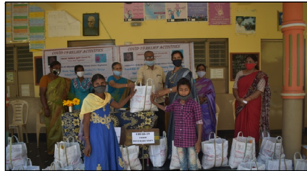
“Distribution of food kit for Bridge School Children to fight COVID lockdown”

With the support of Asha for Education, Seattle Vikasana team was able to mobilize and distribute around 150 food kit/ ration kit for very poor and needy individuals during this pandemic situation, the food kit was sufficient to feed a family with four for minimum 5days with three meals a day. 300 biscuits, 500 re-usable mask and 200 sanitizer bottles for 200 families was distributed among the identified needy individuals who could not afford for mask Distributed 2500 handbills and wall stickers, Displayed around 10 banners in the public to create awareness about COVID-19 preventive measures and precautions, Organised five awareness and sensitization programmes on preventive measures from COVID-19 with especially for women, children, parents and handicapped.