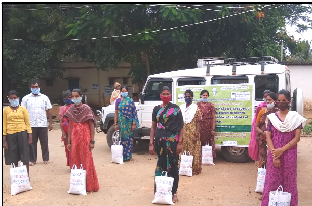
“Distribution of food kits for needy at Nagavangala Village”

Vikasana has been working in 20 villages in Tarikere block. During this COVID-19 situation and medical emergency, the entire country was shut down from middle of March which has affected mostly the migrant and daily labours. This has affected even our rural people for their livelihood, thus Vikasana team has taken initiatives in distributing food kits, mask, sanitizers, biscuit for children and also creating awareness through distribution of posters.