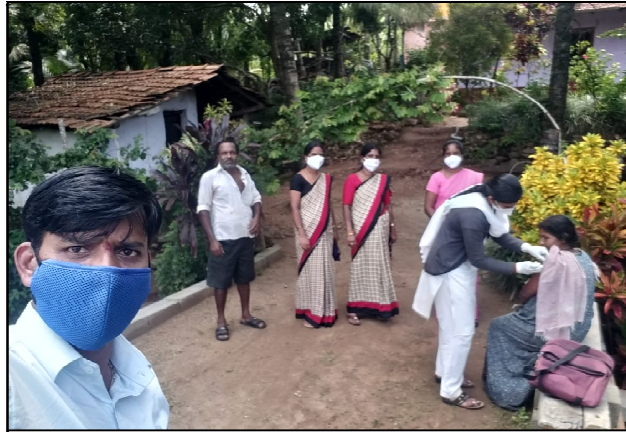
“Free Village level COVID Vaccination in 3 villages of Tarikere Gram Panchayath”

All these EWRs are not only effectively working in their respective panchayat but are also actively monitoring the standing committees. They also understood the role of GPs in preventing sexual harassment and importance for women gram saba. Besides, EWRs are in regularly connected with school, mid-day meals, SDMC committee issues, anganwadi, bala vikasa samithi, mothers meeting, adolescents, pregnant women, lactating mothers, ASHA workers, ANM and monitoring the effective work to be reached to right beneficiaries.