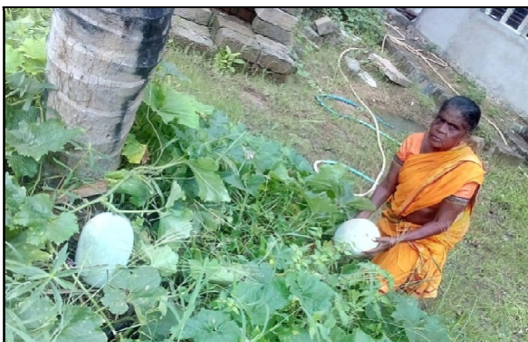
“Pumpkins cultivated in Asha land in Duglapura”

The team of VIKASANA has been constantly working on the development activities and utilization of land supported by ASHA for Education, Seattle. The land was supported with the objective to run sustainable bridge school education to the most needy and backward children in rural region. This year we have received an average rainfall in the beginning of the monsoon which has helped in involving in agricultural land development activities. As a result of it we were able see some progressive growth in